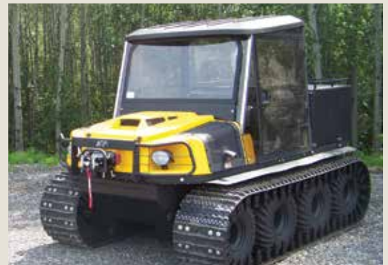
Modify your ARGO XT to suit your specific needs. See page 6 for a list of our ever developing accessories; from cab enclosures to cargo boxes, tracks and more.