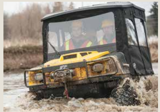
ARGO XT models feature a technologically advanced, direct drive triple differential ADMIRAL transmission.

Seat belts must be worn by all occupants if a ROPS is installed however, they must be unfastened before water entry. For safety, we recommend wearing approved helmets and eye protection. When operating in water, always wear approved Personal Floatation Devices. Always remain seated while in the ARGO.