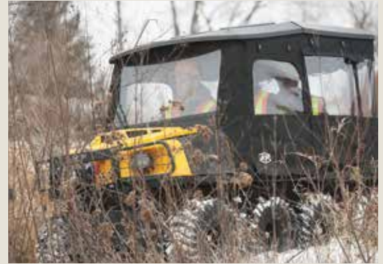
Field driven technology ensures maximum performance, durability and comfort.