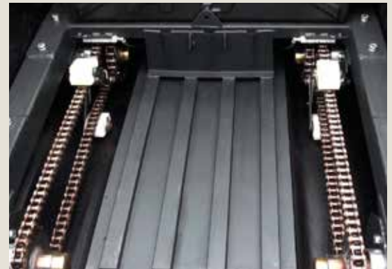
3" Tubular frame and reversible chain adjusters