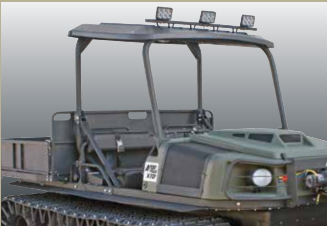
Optional, certified ROPS for two or four passengers is available with hard top for sun / rain protection and a light bar to add auxiliary lighting.