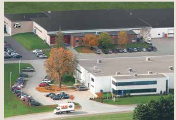
Where we proudly build the ARGO...