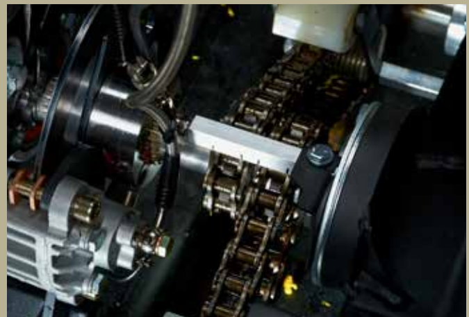
Optional automatic chain lubrication system featuring reduced maintenance requirements and longer chain life.