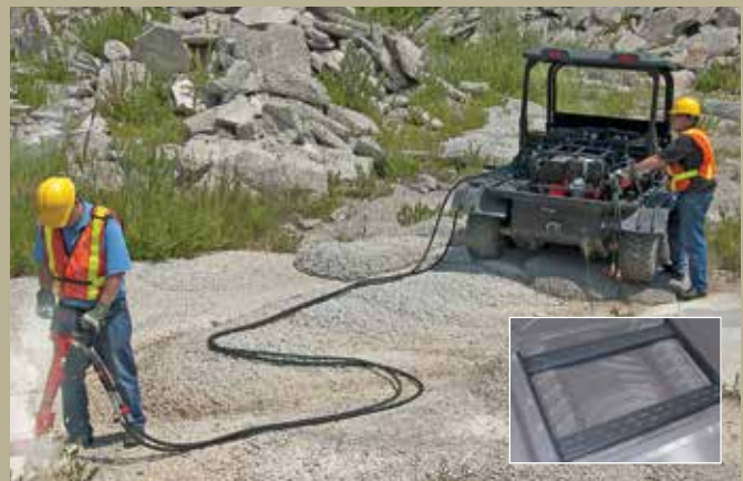
Hydraulic power pack made by Chicago Pneumatic. Installation with quick connect ARGO Universal Mounting System (Inset).