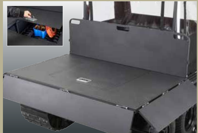
Optional, easily removable flatbed platform with access panel to storage area. Custom cargo configurations can be created by adding stakes, hinged or fixed side panels and tailgate.