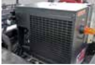
Hydraulic Compressor courtesy of VMAC.

Large rear cargo area allows space for additional seating or mounting of third party equipment.