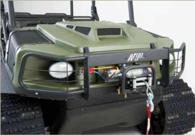
Halogen headlights, optional brushguard, 4,500 lb. (2,041 kg) power winch (optional) and skid plate for lower body protection.