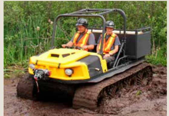
The low center of gravity and full-time, eight-wheel drive provides sure-footed traction and maneuverability.