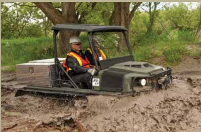
ARGO Utility Box protects and provides ample storage for equipment and tools.

All season ARGO 8x8 XT models are reliable partners in the toughest conditions imaginable, safely transporting your crew and gear to remote locations not accessible by traditional vehicles.