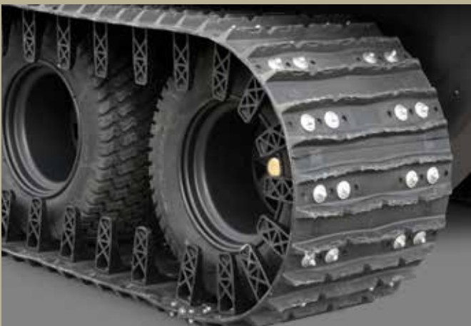
Optional 18" (457 mm) rubber tracks with heavy duty UHMW-PE guides on high impact resistant 24" (610 mm) tires and reinforced rims. www.ARGOxtv.com/catalog/tracks