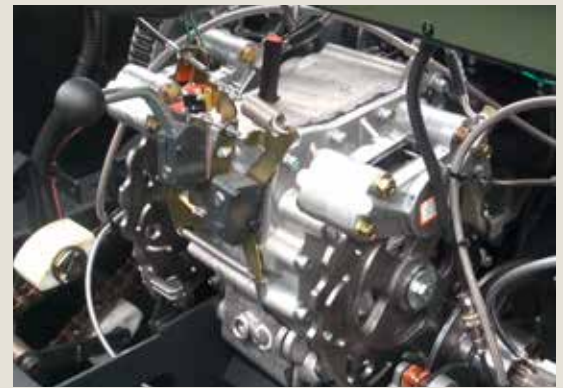
Direct drive ADMIRAL steering transmission