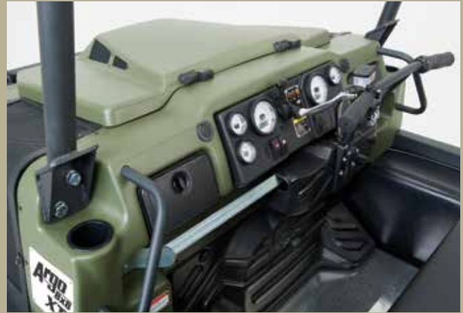
Multi-position steering system, instrumentation panel and convenience package (two cup holders, two storage compartments and two 12 volt outlets).